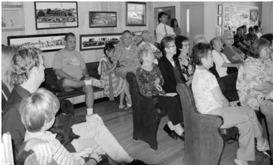
Lahaina group at Fuji Matsuri service.