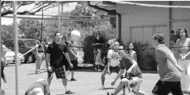
There it is ... who's got it?

Lahaina's Volleyball team had the spirit and the moves to win the games and retain the trophy from 10 years ago. Is it time to bring volleyball back for annual games?